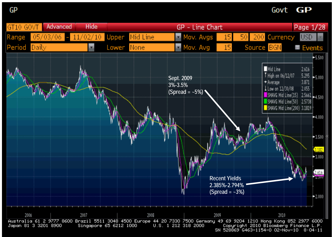
Exhibit 3: Recent US 10-year Yields Range from 2.385% to 2.794% - Spread suggests ~3% for Bolivia risk